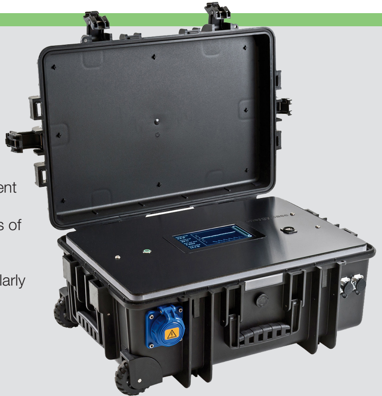
P/N CASE ENERGY

Its wheels and telescopic handle make it particularly easy to transport.